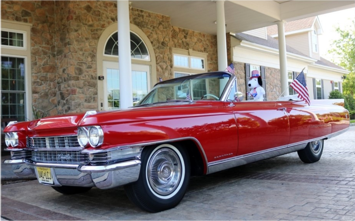
Nothing like July 4 th in a 1963 Eldorado Biarritz!