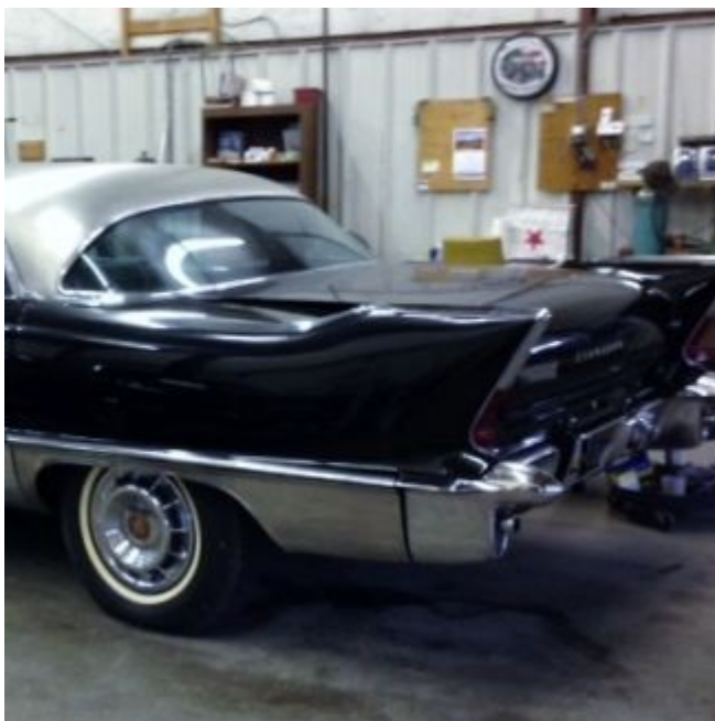
1958 Eldorado Brougham