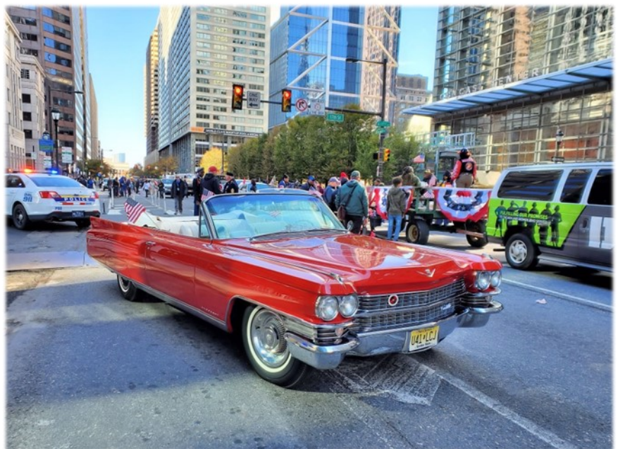
Philadelphia Veteran's Day Parade 2019

I always had the "Car Bug", but with kids and family, cars took the back burner. I always loved Cadillacs and back in the 80s, my folks gave me a gold 1970 Cadillac while I was in college. Wish I kept it. My uncles had 60s Cadillacs and I always wanted a land yacht. Loved the fins. When I decided to get a Cadillac, I was considering 59-64. I viewed probably hundreds on-line and gravitated to a few. I selected the 63 Eldorado because it was gorgeous. All original for the most part. I did what was needed to get it closer to perfect.