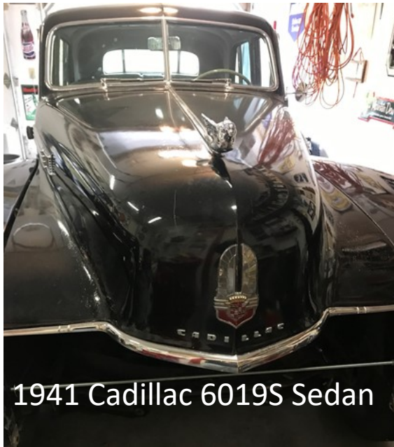
1941 Cadillac 6019S Sedan